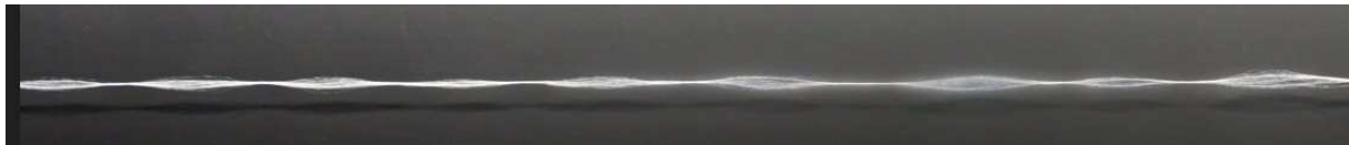
PES HT 1100f192 TG-3 HP405A-WO70-4.0.JPG

PolyJet-TG-3-HP405A/WO70 (TopAir) – yarn evenness (magnified x1.25)